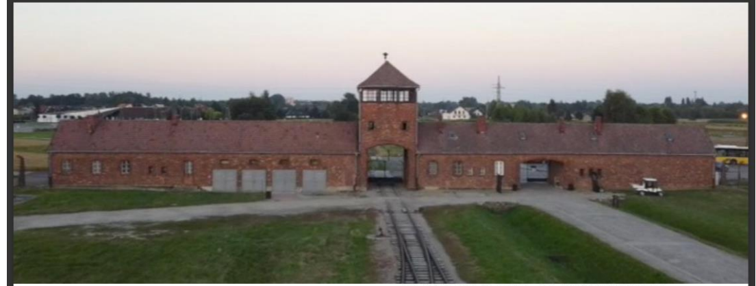
LA CATEGORIA ZINGARI